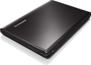
Lenovo G480/G580 Dark Brown (hairline)